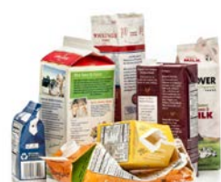
Dairy & Juice Cartons