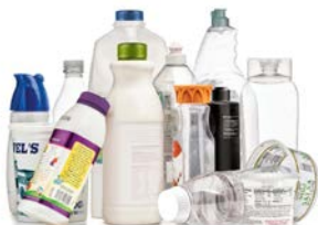
Plastic Bottles & Containers #1, #2 & #5