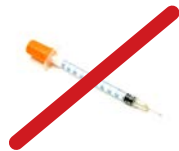
Sharps & Medical Waste