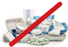
Foam Cups & Containers